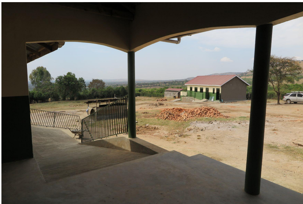
View from the Dining Hall to the sports field and the Boys Dormitory.