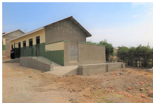
Left the Boys and right the Girls Dormitory