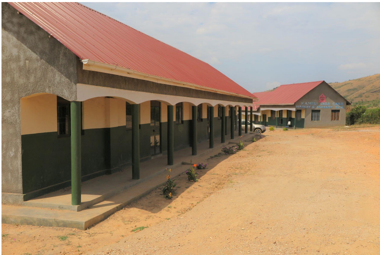
The new block with 3 classrooms constructed in 2021 under the Action Plan 2020 (P2019-0329). The construction was severely delayed by to corona pandemic. Right with the text on the wall is the Administration.