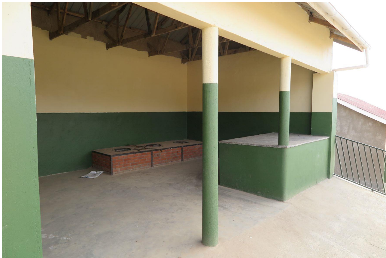
The Kitchen with -next to it- the Girls Dormitory

Mobile: +256752766402 Email: tul.sharifa@gmail.com