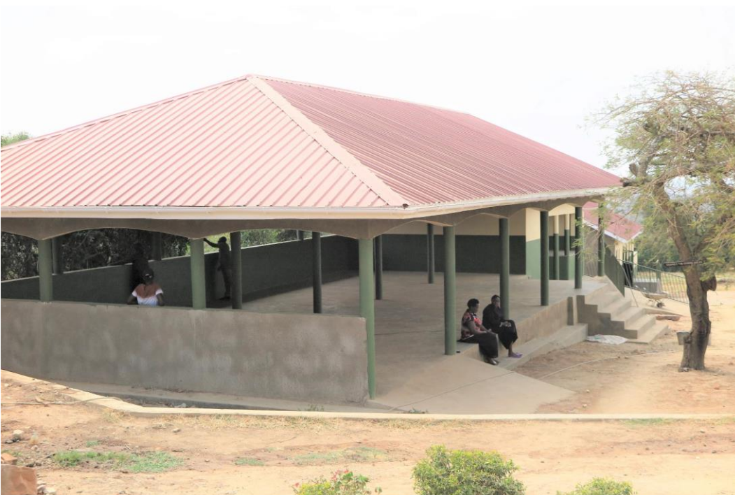
The Dining Hall

School management is already beautifying the school compound during construction with plants and flowers.