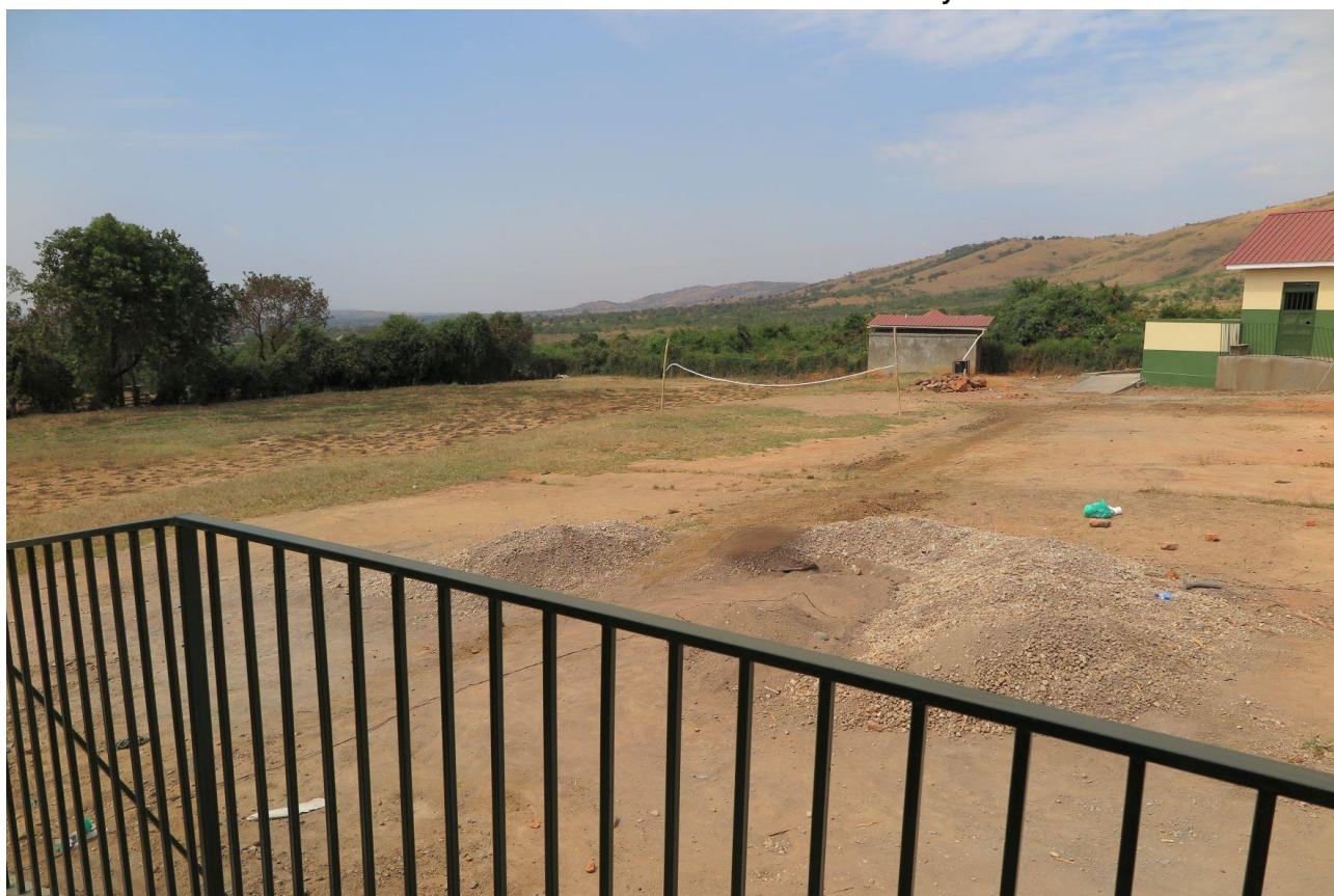
View from the Girls Dormitory to the sports field and Boys Dormitory. The grass is waiting for the rainy season.