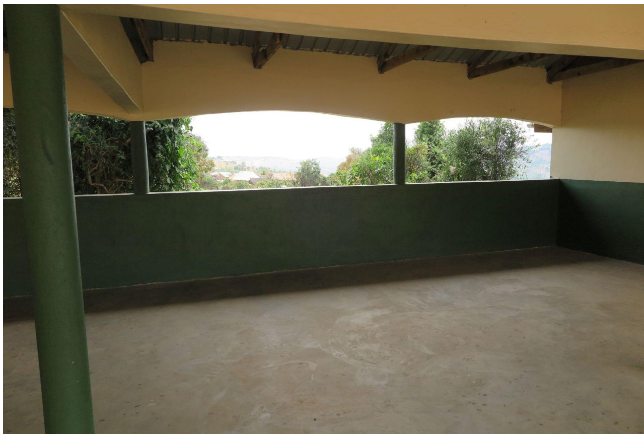
Dining Hall: view to the outside

Mobile: +256752766402 Email: tul.sharifa@gmail.com